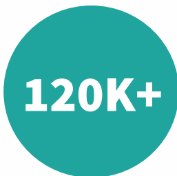
Social Media Impressions